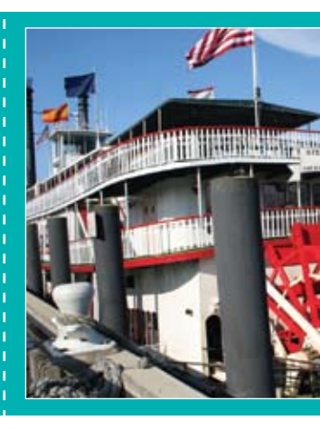
Maritime heritage fosters a strong sense of place in New Orleans, Louisiana.

priority. The resulting redevelopment plan focused on strengthening these assets through targeted investments in the working waterfront and historic district, including a wayfinding signage program.<sup>26</sup>