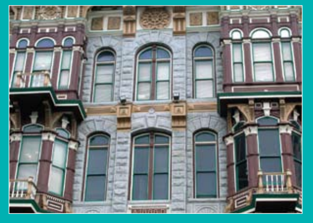
The distinctive Victorian-style houses around San Francisco, California's Alamo Square have become the backdrop for many popular postcards of the city.